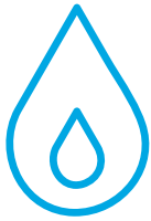
Oil, Gas & Industrials