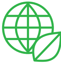
Environment and Sustainability